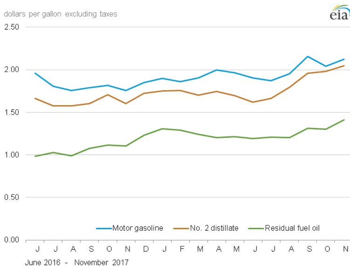
Figure 2. U.S. Refiner retail petroleum product prices